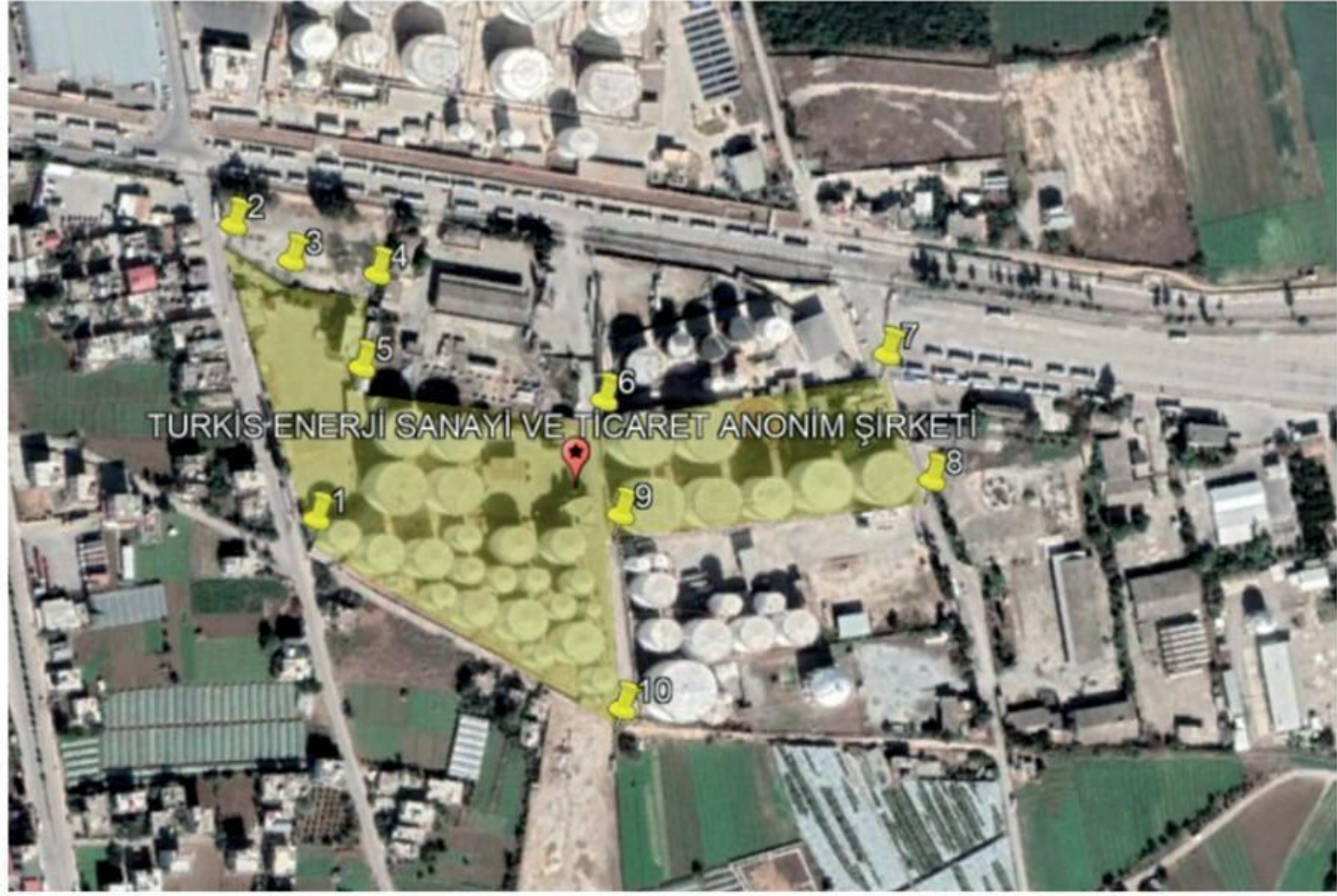
Kuruluş alanını gösterir koordinat bilgileri